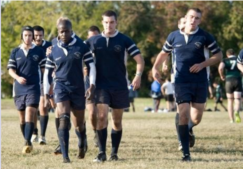
More Photos—from Rice vs. Angelo State (mostly second side) To see more photos from this game, go to http://billarnold.zenfolio.com under “Rice Rugby”